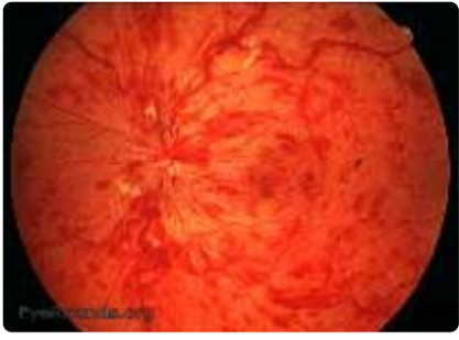
3& 4 Non-Ischemic CRVO